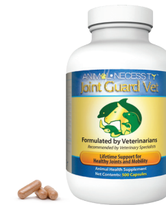
Joint Guard Vet™

A beta-glucan supplement providing immune stimulation properties to white blood cells.