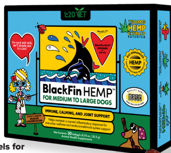
Softgels for medium/large dogs